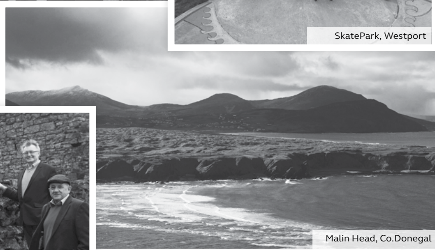
Malin Head, Co. Donegal