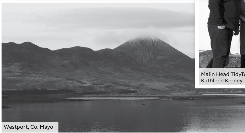
Westport, Co. Mayo